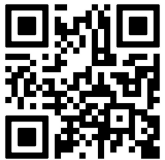
SSC & Council

Listen online on Zoom or these YouTube channels: